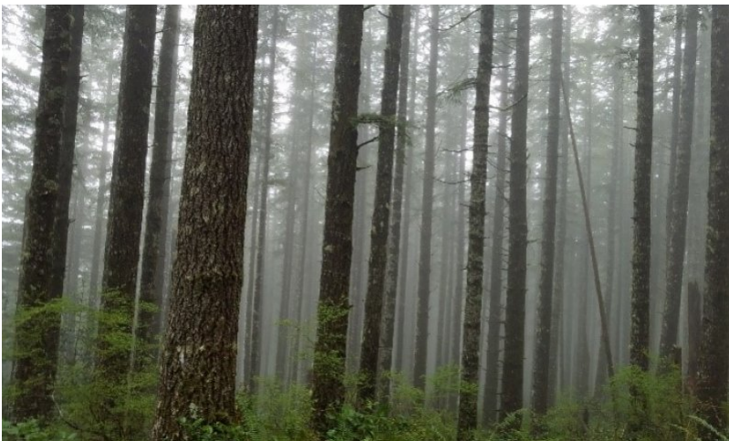
Western hemlock – Douglas-fir / salal – Pacific rhododendron / western swordfern – common beargrass Structure: