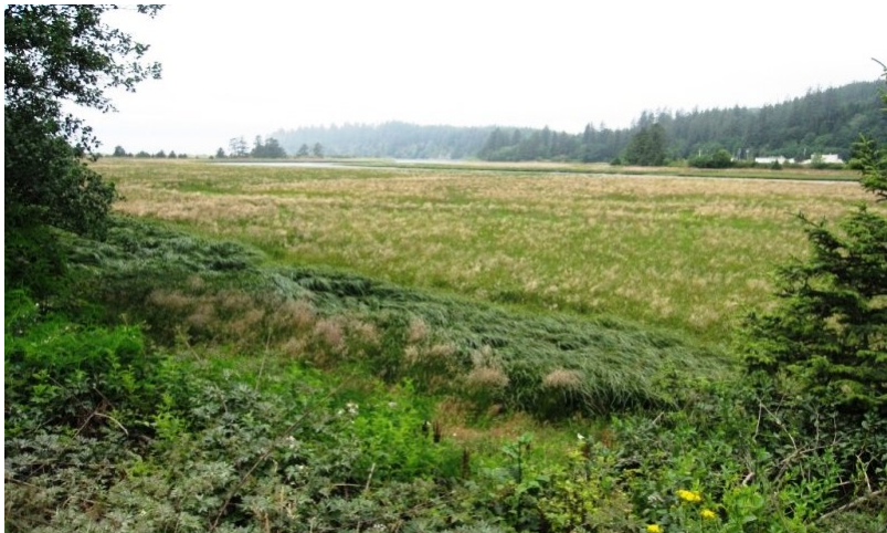
Figure 4. Backshore shrub community view of estuary

The Tufted hairgrass ( Deschampsia cespitosa ) – Douglas aster ( Symphotrichum subspicatu ) plant community phase is widespread in estuaries. The Tufted hairgrass – Douglas aster plant community phase occurs in the Upper tidal meadow zone between the backshore shrub communities and the middle tidal marsh, usually in broad and