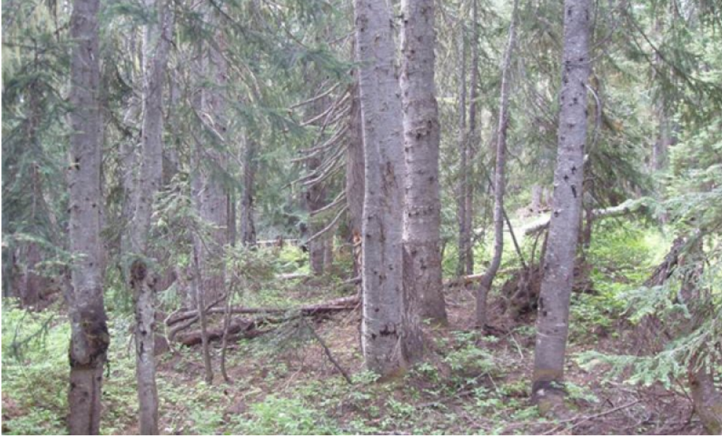
Figure 5. Reference Community

Structure: multistory with small gap dynamics Community Phase 1.1 - Reference Community. The dominant overstory species are mountain hemlock ( Tsuga mertensiana ) and subalpine fir ( Abies lasiocarpa ). Other common trees species include Alaska yellow-cedar ( Callitropsis nootkatensis ), whitebark pine ( Pinus albicaulis ) and Pacific silver fir ( Abies amabilis ). Mountain hemlock and subalpine fir and Pacific silver fir are more susceptible to windthrow than the other overstory species on this site so wind events (as well as pockets of rot) can alter the forest species composition. The ensuing small canopy gaps allow for an increase in the understory of shrubs such as black huckleberry, Sitka mountain-ash, pink mountainheather, Cascade huckleberry and white mountainheather ( Cassiope mertensiana ) as well as forbs such as Sitka valerian, false hellebore, western meadow-rue and various graminoids.