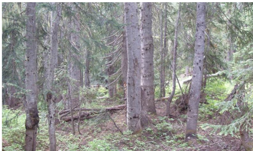
Figure 5. Reference Community

Structure: multistory with small gap dynamics Community Phase 1.1 - Reference Community. The dominant overstory species are mountain hemlock ( Tsuga mertensiana ) and subalpine fir ( Abies lasiocarpa ). Other common trees species include Alaska yellow-cedar ( Callitropsis nootkatensis ), whitebark pine ( Pinus albicaulis ) and Pacific silver fir ( Abies amabilis ). Mountain hemlock and subalpine fir and Pacific silver fir are more susceptible to windthrow than the other overstory species on this site so wind events (as well as pockets of rot) can alter the forest species composition. The ensuing small canopy gaps allow for an increase in the understory of shrubs such as black huckleberry, Sitka mountain-ash, pink mountainheather, Cascade huckleberry and white mountainheather ( Cassiope mertensiana ) as well as forbs such as Sitka valerian, false hellebore, western meadow-rue and various graminoids.