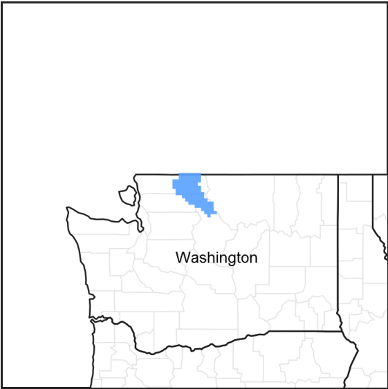
Figure 1. Mapped extent

Provisional. A provisional ecological site description has undergone quality control and quality assurance review. It contains a working state and transition model and enough information to identify the ecological site.