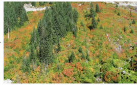
Pacific silver fir-western hemlock/Sitka alder/common ladyfern

This pathway represents an extended time with no disturbance from avalanches, which allows trees to become established.