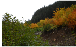
Sitka alder-vine maple/red elderberry/thimbleberry

This pathway represents a disturbance such as a wildfire or a major avalanche or series of avalanches that reclaims the original extent of the avalanche chute.