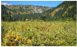
Alaska cedar-Sitka alder/Barclay's willow/five-leaved bramble