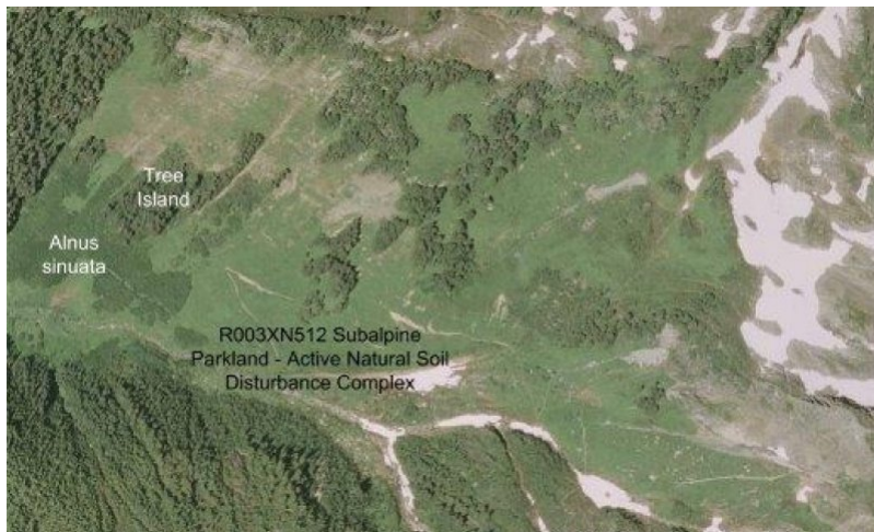
Figure 5. Interplay between R003XN502WA and R003XN512WA.

Vegetation is characterized by a predominance of forbs, grasses and grass-like plants. Common species present on the site include blue wildrye ( Elymus glaucus ), greenleaf fescue ( Festuca viridula ), smooth woodrush ( Luzula glabrata ), subalpine lupine ( Lupinus arcticus ssp. subalpinus ), false hellebore ( Veratrum viride ), Sitka valerian ( Valeriana sitchensis ), showy sedge ( Carex spectabilis ), American bistort ( Polygonum bistortoides ), partridgefoot ( Luetkea pectinata ), avalanche lily ( Erythronium montanum ), woolly pussytoes ( Antennaria lanata ), and Sitka mountain-ash ( Sorbus sitchensis var. sitchensis ).