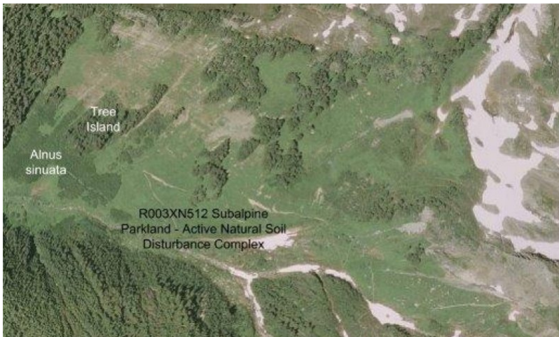
Figure 5. Interplay between R003XN502WA and R003XN512WA.