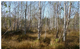
Red Alder, Black Cottonwood, Scouler's Willow, Sitka Willow, and Coastal Hedgenettle