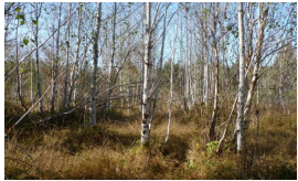
Red Alder, Black Cottonwood, Scouler's Willow, Sitka Willow, and Coastal Hedgenettle