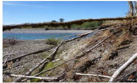
Red Alder, Black Cottonwood, Trailing Blackberry, and Blue Wildrye

This pathway represents a stand-replacing wildfire or a major 100- or 500-year flood that scours the stream channel, removes the understory and overstory vegetation, and may alter the streamflow. This type of disturbance may completely reconfigure sediment loads and dramatically reduce or eliminate the forest overstory.