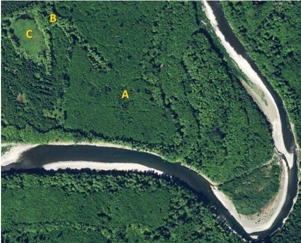
Figure 1. The area identified as 'A' is the Udic Flood Plain Forest (F04AA001WA) ecological site, the area identified as 'B' is the Aquic Flood Plain Forest (F04AA002WA) site, and the area identified as 'C' is the Aquic Flood Plain (R04AA003WA) site.

The most common natural disturbance is flooding. The volume and longevity of the flooding determine the effect on the dynamics of the forest. Wildfires are uncommon in this ecological site (greater than 450-year return interval), but they may be stand replacing (Balian, 2005). The longer the interval between major floods, the more diverse the overstory becomes as conifers establish. In the absence of disturbance, it is expected that forest maturation and succession will result in an old-growth conifer forest (Van Pelt, 2006).