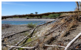
Red alder-black cottonwood/trailing blackberry/blue wildrye Structure: Bare ground with scattered tree, shrub, and grass establishment

This pathway represents a stand-replacing wildfire or a major 100- or 500-year flood that scours the stream channel, removes the understory and overstory vegetation, and may alter the streamflow. This type of disturbance may completely reconfigure sediment loads and dramatically reduce or eliminate the forest overstory.