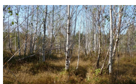
Red alder-black cottonwood/Scouler's willow-Sitka willow/coastal hedgenettle