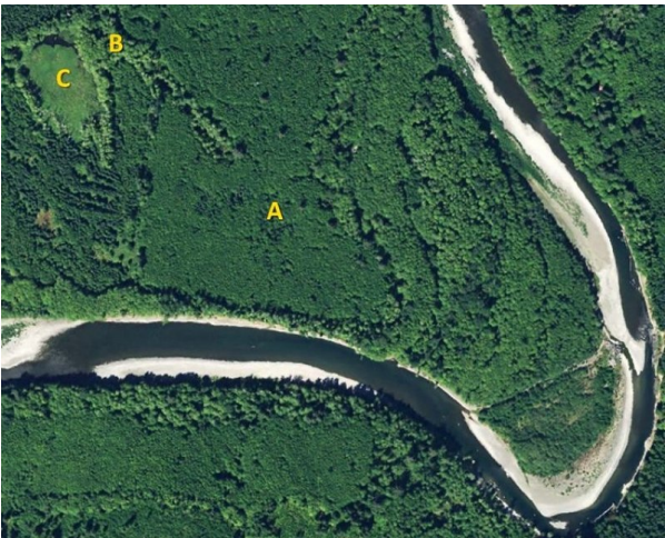
Figure 1. The area identified as ‘A’ is the Udic Flood Plain Forest (F04AA001WA) ecological site, the area identified as ‘B’ is the Aquic Flood Plain Forest (F04AA002WA) site, and the area identified as ‘C’ is the Aquic Flood Plain (R04AA003WA) site.

Regeneration is limited by the canopy cover, and it commonly is only in gaps where sunlight is most available. Common understory species include vine maple ( Acer circinatum ), salmonberry ( Rubus spectabilis ), red elderberry ( Sambucus racemosa ), western swordfern ( Polystichum munitum ), ladyfern ( Athyrium filix-femina ), and Oregon oxalis ( Oxalis oregana ). The most common natural disturbance is flooding. The volume and longevity of the flooding determine the effect on the dynamics of the forest. Wildfires are uncommon in this ecological site (greater than 450-year return interval), but they may be stand replacing (Balian, 2005). The longer the interval between major floods, the more diverse the overstory becomes as conifers establish. In the absence of disturbance, it is expected that forest maturation and succession will result in an old-growth conifer forest (Van Pelt, 2006).