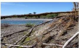
Red alder-black cottonwood/trailing blackberry/blue wildrye Structure: Bare ground with scattered tree, shrub, and grass establishment