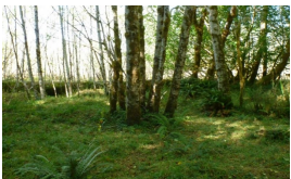
Black cottonwood-red alder/vine maple-willow/western swordfern/sedge Structure: Single story with diminished understory