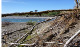
Red alder-black cottonwood/trailing blackberry/blue wildrye Structure: Bare ground with scattered tree, shrub, and grass establishment

This pathway represents a stand-replacing wildfire or a major 100- or 500-year flood that scours the stream channel, removes the understory and overstory vegetation, and may alter the streamflow. This type of disturbance may completely reconfigure sediment loads and dramatically reduce or eliminate the forest overstory.