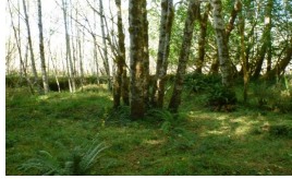
Black cottonwood-red alder/vine maple-willow/western swordfern/sedge Structure: Single story with diminished understory

This pathway represents growth over time with no further major disturbance.