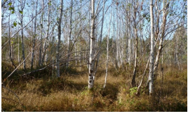
Red alder-black cottonwood/Scouler's willow-Sitka willow/coastal hedgesettle Structure: Single story