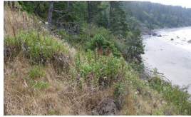
Canada goldenrod-common yarrow/Pacific reedgrass-red fescue Structure: Coastal prairie dominated by forbs and grasses

This pathway represents a major stand-replacing disturbance such as a high-intensity fire, a large-scale wind event, or large mass movement that leads to the stand initiation phase of forest development.