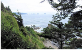
Sitka spruce-shore pine/salal-evergreen huckleberry/false lily of the valley-western brackenfern Structure: Wind-pruned trees with shrubs and forbs