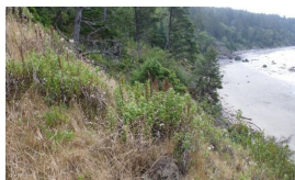
Canada goldenrod-common yarrow/Pacific reedgrass-red fescue

This pathway represents a major stand-replacing disturbance such as a high-intensity fire, a large-scale wind event, or large mass movement that leads to the stand initiation phase of forest development.