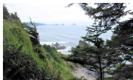
Sitka spruce-shore pine/salal-evergreen huckleberry/false lily of the valley-western brackenfern