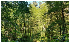
Red alder-Sitka spruce/salmonberry-red elderberry/western swordfern-common ladyfern