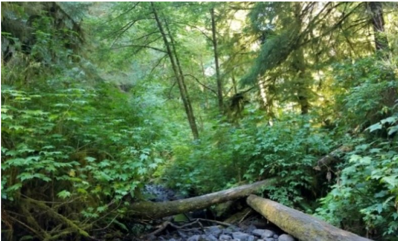
Figure 2. Small gap dynamics in reference community.