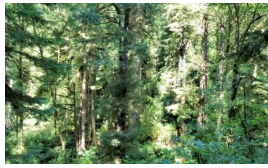
Sitka spruce-red alder/salmonberry-rusty menziesia/Oregon oxalis-common ladyfern

This pathway represents no further major disturbance. Continued growth over time and ongoing mortality lead to increased vertical diversification. The community begins to resemble the structure of the reference community, including small pockets of regeneration (both deciduous and coniferous) and a more diversified understory.