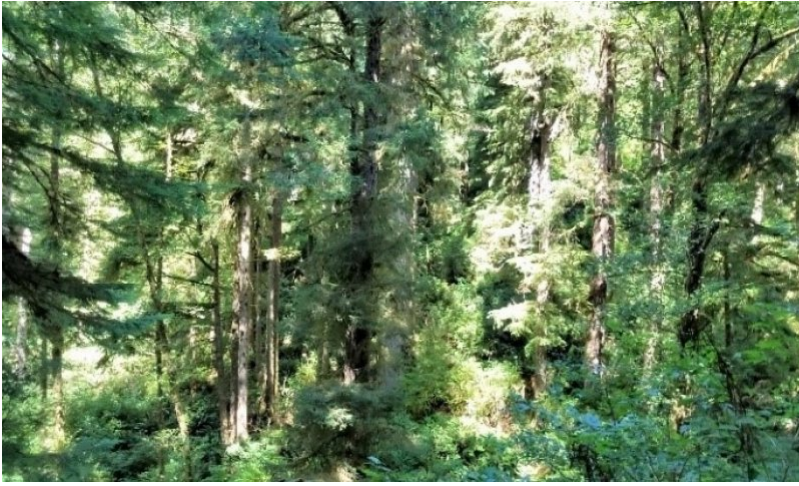
Figure 1. Mature reference community.