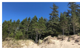
Sitka Spruce, Shore Pine, Salal, Evergreen Huckleberry, and Western Brackenfern

This pathway represents a transition toward dune stabilization as a result of increasing plant diversity and cover.