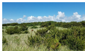
Shore Pine, Salal, Evergreen Huckleberry, and Beach Lupine