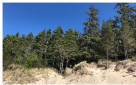
Sitka spruce-shore pine/salal- evergreen huckleberry/western brackenfern

This pathway represents a transition toward dune stabilization as a result of increasing plant diversity and cover.