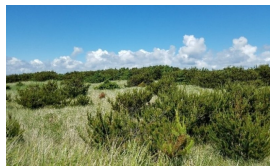
Shore pine/salal-evergreen huckleberry/beach lupine