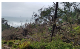
Red Alder, Red Elderberry, Salmonberry, Western Swordfern, and Coastal Hedgenettle

This pathway represents a major stand-replacing disturbance such as a high-intensity fire, timber management, a large-scale wind event, a major insect infestation, or large mass movement that leads to the stand initiation phase of forest development.