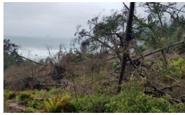
Red Alder, Red Elderberry, Salmonberry, Western Swordfern, and Coastal Hedgenettle

This pathway represents a major stand-replacing disturbance such as a high-intensity fire, timber management, a large-scale wind event, a major insect pest infestation, or large mass movement that leads to the stand initiation phase of forest development.