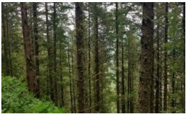
Sitka Spruce, Western Hemlock, Salmonberry, Salal, Western Swordfern, and Common Ladyfern