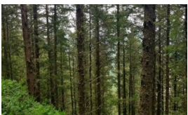
Sitka Spruce, Western Hemlock, Salmonberry, Salal, Western Swordfern, and Common Ladyfern