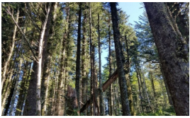
Sitka Spruce, Western Hemlock, Salal, Salmonberry, Western Swordfern, and False Lily of the Valley