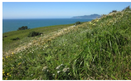
Canada Goldenrod, Common Yarrow, Pacific Reedgrass, and Red Fescue

This pathway represents a major stand-replacing disturbance such as a high-intensity fire, a large-scale wind event, or large mass movement that leads to the stand initiation phase of forest development.