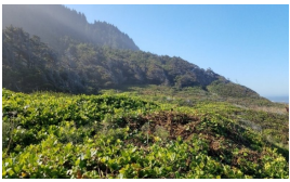
Salal, Salmonberry, Canada Goldenrod, Western Brackenfern, Pacific Reedgrass, and Red Fescue