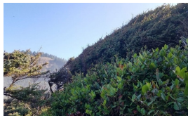
Sitka Spruce, Shore Pine, Salal, Salmonberry, Western Brackenfern, and Pacific Reedgrass

This pathway represents growth over time with no further major disturbance.