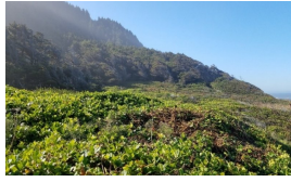
Salal, Salmonberry, Canada Goldenrod, Western Brackenfern, Pacific Reedgrass, and Red Fescue

This pathway represents growth over time with no further significant disturbance.