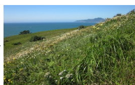
Canada Goldenrod, Common Yarrow, Pacific Reedgrass, and Red Fescue

This pathway represents a major stand-replacing disturbance such as a high-intensity fire, a large-scale wind event,