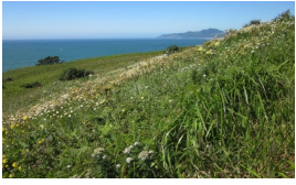
Canada Goldenrod, Common Yarrow, Pacific Reedgrass, and Red Fescue