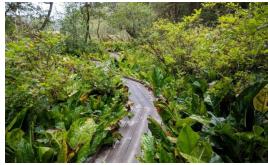
Red Alder, Salmonberry, Red Elderberry, American Skunkcabbage, Common Ladyfern, and Slough Sedge

This pathway represents growth over time with no further major disturbance.