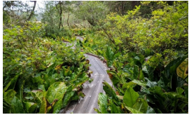
Community Phase 1.3: Red alder/salmonberry-red elderberry/American skunkcabbage-common ladyfern/slough sedge