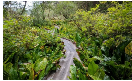
Community Phase 1.3: Red alder/salmonberry-red elderberry/American skunkcabbage-common ladyfern/slough sedge

This pathway represents growth over time with no further major disturbance.