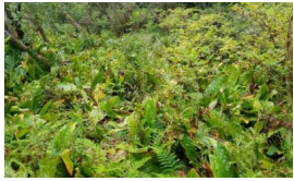
Community Phase 1.2: American skunkcabbage-common ladyfern/slough sedge