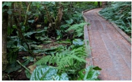
Reference Community Phase 1.1: Sitka spruce-red alder/salmonberry/American skunkcabbage