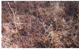
Bog Labrador tea-western bog laurel/sedge/sphagnum Structure: Wet depression dominated by shrubs, forbs, sedges, and sphagnum mosses

This pathway represents a climatic change toward wetter conditions or restoration from periodic wildfire. If the site becomes wetter by excessive ponding or flooding, the duration of soil saturation will increase. This will impact the growing season and alter the plant community.