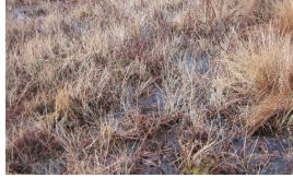
Sedge/sphagnum Structure: Saturated depression dominated by sedges and sphagnum mosses

This pathway represents a climatic change toward wetter conditions. If the site becomes wetter from increased precipitation, the depth to a water table will decrease and the duration of flooding or ponding will increase. This will restrict drainage and alter the plant community.