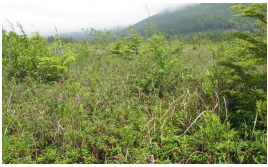
Bog Labrador tea-rose spirea/sedge Structure: Dry phase depression or slightly elevated organic deposits with shrub and forb encroachment