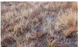
Sedge/sphagnum Structure: Saturated depression dominated by sedges and sphagnum mosses