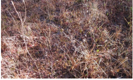
Bog Labrador tea-western bog laurel/sedge/sphagnum Structure: Wet depression dominated by shrubs, forbs, sedges, and sphagnum mosses