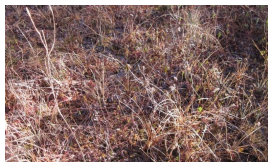
Bog Labrador tea-western bog laurel/sedge/sphagnum Structure: Wet depression dominated by shrubs, forbs, sedges, and sphagnum mosses

This pathway represents a climatic change toward drier conditions or an absence of periodic wildfires. If the site becomes drier from reduced precipitation, the depth to a water table will increase and the duration of ponding will decrease. This will lengthen the growing season and alter the plant community.