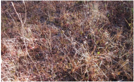
Bog Labrador tea-western bog laurel/sedge/sphagnum Structure: Wet depression dominated by shrubs, forbs, sedges, and sphagnum mosses