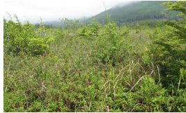
Bog Labrador tea-rose spirea/sedge Structure: Dry phase depression or slightly elevated organic deposits with shrub and forb encroachment

This pathway represents a climatic change toward drier conditions. If the site becomes drier from reduced precipitation, the depth to a water table will increase and the duration of ponding will decrease.