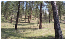
Reference Plant Community