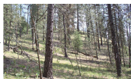
Stand Re-initiation Phase