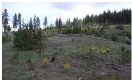
Stand Initiation Phase