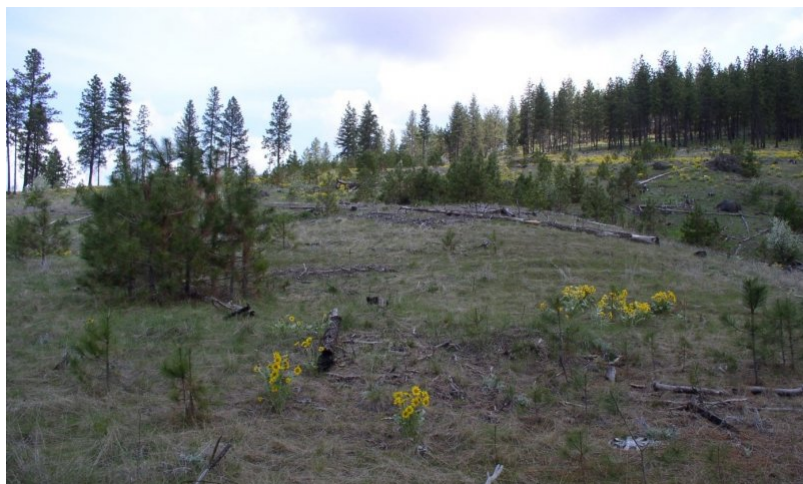
Figure 4. Ponderosa pine / Idaho fescue site with stand replacing fire. Pine seedlings established in clumps after 10 years.

Understory pine stand killed by fire, some larger overstory pine killed. Overstory crown cover may be reduced to