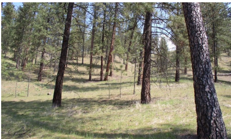
Figure 2. Ponderosa pine/bluebunch wheatgrass site on south slope. Open grown pine stand.