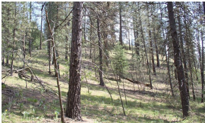
Figure 3. Understory pine become established. Occasional Douglas-fir and shrubs may be present.

Large overstory Ponderosa pines remain at a 10%-30% cover. A prolonged fire interval allows understory pine start to establish. Bunchgrass cover reduced. Woodland shrubs and fir may establish at higher elevations.