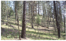
Stand Re-initiation Phase