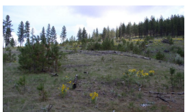
Stand Initiation Phase