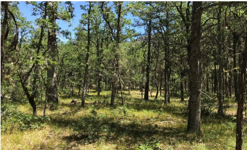
Figure 2. Ponderosa pine – White oak / Elk Sedge

Open to moderately open stand of white oak with limited amount of ponderosa pine. Understory vegetation abundant along with oak regeneration.