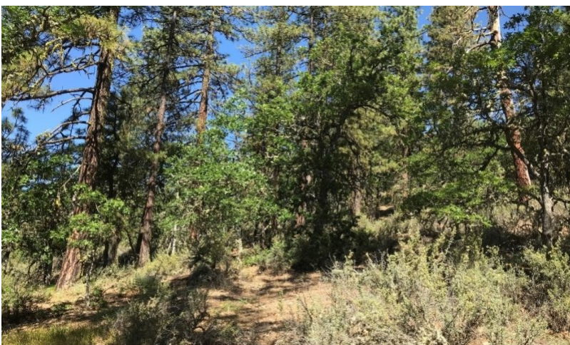
Figure 3. Ponderosa pine – White Oak /Bitterbrush

Long intervals of fire exclusion have increased stand density in oaks and advanced the encroachment of pine and