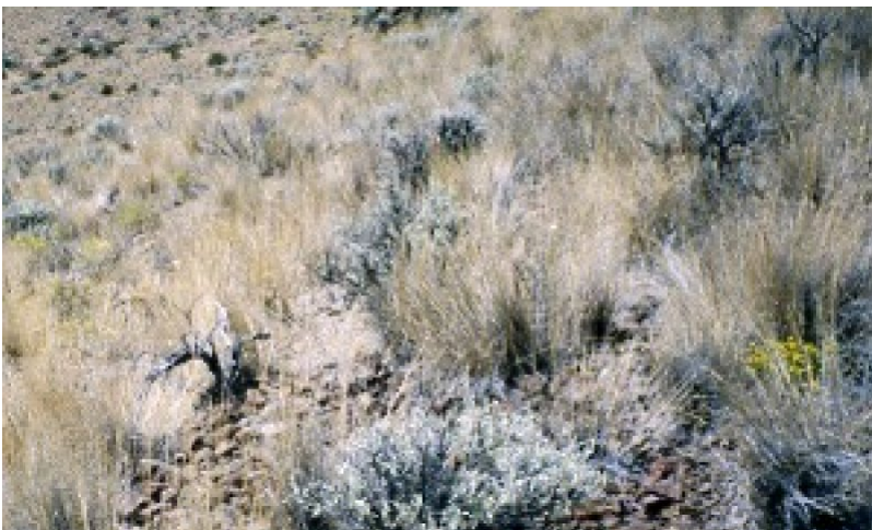
Figure 4. JD Droughty South 9-12, State A

HCPC - Dominated by Thurber Needlegrass and Bluebunch Wheatgrass. This plant community evolved with limited grazing by large herbivores and with fire frequency of every 5 to 15 years. About 5% of the plant composition is made up of forbs and 8% of shrubs. Bluebunch Wheatgrass increases with clay surface and decreases in gravel.