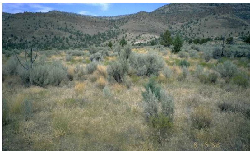
Figure 7. JD Droughty South 9-12" PZ, State C

A community dominated by Broom Snakeweed, Cheatgrass and Medusahead. Continued mismanagement of this site with fire disturbance has caused the deterioration. The site has passed a threshold and cannot naturally return to a previous state. Mechanical manipulation is needed to bring this site back to a productive state.