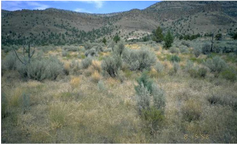
Figure 7. JD Droughty South 9-12" PZ, State C

A community dominated by Broom Snakeweed, Cheatgrass and Medusahead. Continued mismanagement of this site with fire disturbance has caused the deterioration. The site has passed a threshold and cannot naturally return to a previous state. Mechanical manipulation is needed to bring this site back to a productive state.