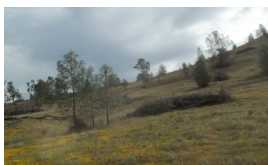
Cleared shrub community