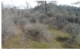
Mature shrub community

This pathway occurs after a considerable amount of time (> 50 years) without fire, under normal growth and development.