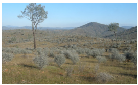
Post-fire plant community