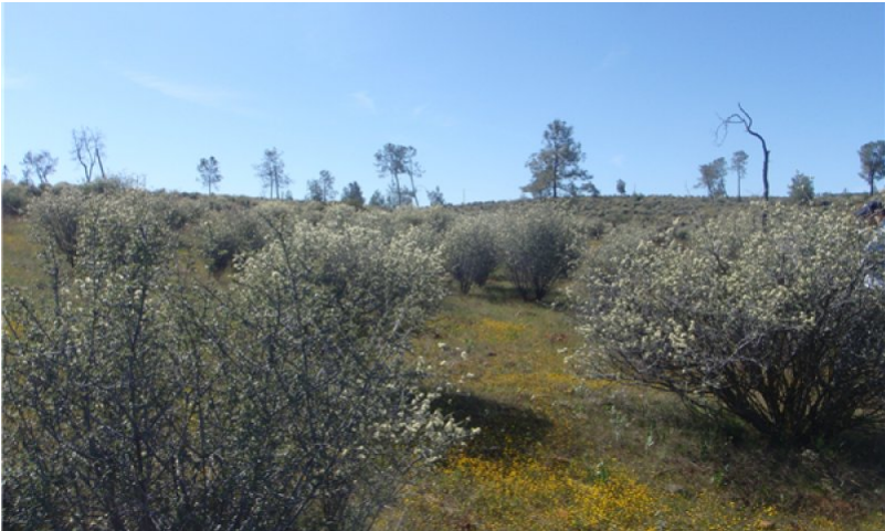
Figure 7. Community phase 1.1 during spring with buckbrush in flower; Photo: D. Evans, 2012.

State 1 represents the historic range of variability for this ecological site. This ecological site may be one of the few examples in California where historic plant communities are still observable. Ultramafic soils often offer a refuge to many native endemic herbaceous species because its unique soil chemistry is not amenable to the vast majority of plant species. Most of the endemic plants are still intact, despite the introduction of a number of annual grasses and forbs arriving after the discovery of the New World.