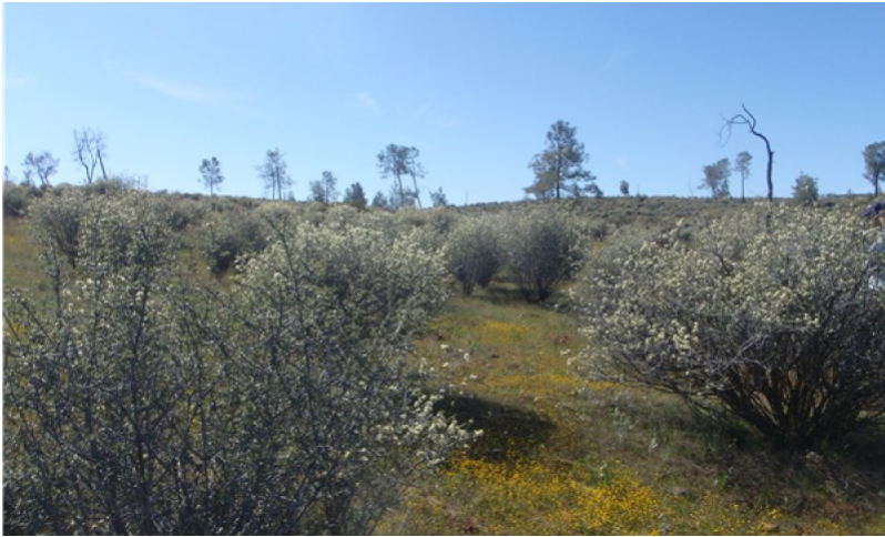
Figure 7. Community phase 1.1 during spring with buckbrush in flower; Photo: D. Evans, 2012.