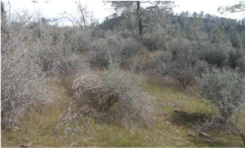
Figure 13. Example of a mature shrub community phase in the Red Hills ACEC., Tuolumne County; Photo: C. Savastio, 2011.