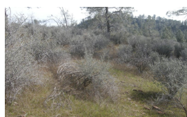
Mature shrub community