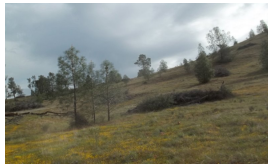
Cleared shrub community

This pathway occurs after most woody vegetation has been mechanically removed. Alternatively, high severity fires may render a similar change in community structure.