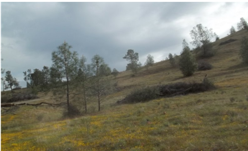
Figure 12. Community Phase 1.3, recently cleared brush (within 3-5 years); Photo: D. Evans, 2013.