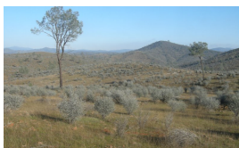
Post-fire plant community