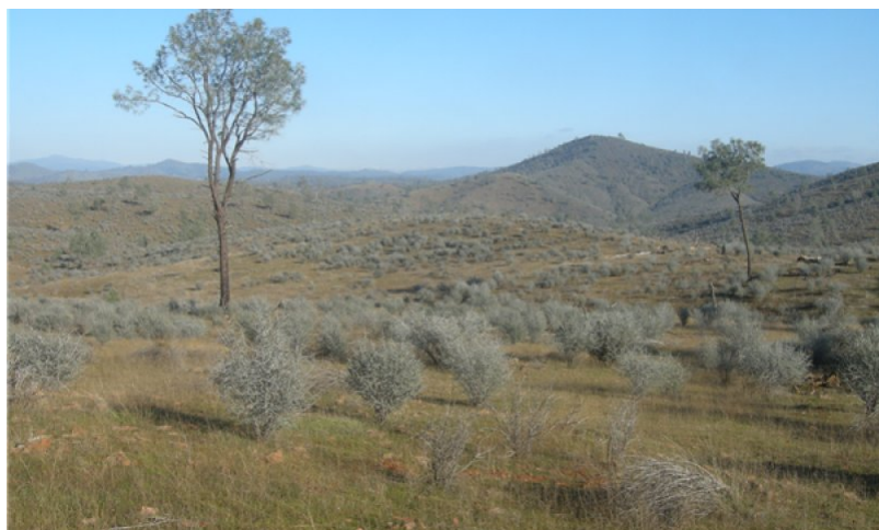
Figure 10. Community Phase 1.2, with buckbrush seedlings in post-fire community; Photo: C. Savastio, 2011.