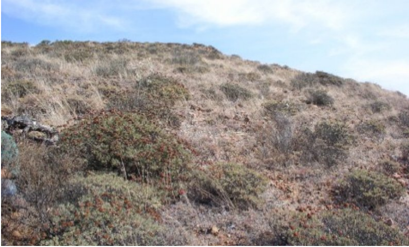
Figure 4. Santa Cruz Island Buckwheat