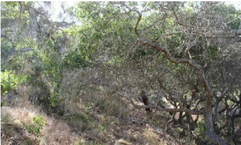
Figure 4. manzanita chaparral