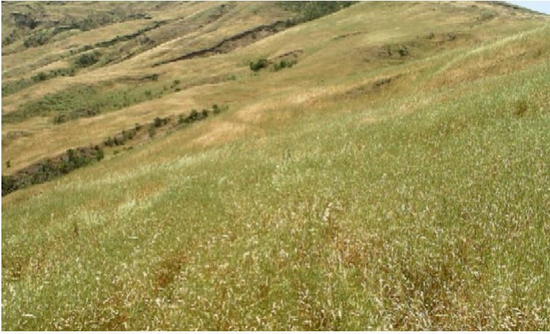
Figure 6. non native annual grassland

The non-native grassland community is common through out California. The primary species are slender oat ( Avena barbata ), wild oat ( Avena fatua ), ripgut grass ( Bromus diandrus ), soft brome ( Bromus hordeaceus ), and Spanish brome ( Bromus madritensis ). The annual production for the non-native annual grasses is precipitation dependent, and highly variable. Site specific factors such as aspect, soil moisture, marine influences, and landscape position also influence annual production. Community Pathway 3.1: The shift from PC 3.1 to PC 3.2 may be linked to severe pig disturbance and the introduction of non-native Mediterranean species. The seeds of the most invasive of these species, yellow star-thistle, are easily spread by car tires, hikers' socks and shoes, and by wildlife, all of which can cause infestation of new areas. Transition 4: In the absence of disturbance from fire or grazing, coastal sagebrush can slowly encroach into PC 3.1, leading to state 4. This tends to be a rare transition.