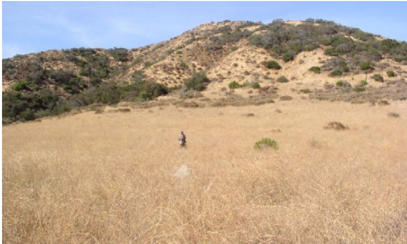
Figure 8. non native invasive forbs

This community was dominated by non-native grasses, but increasingly became invaded by yellow star-thistle ( Centaurea solstitialis ), Maltese star-thistle ( Centaurea melitensis ), black mustard ( Brassica nigra ), shortpod mustard ( Hirschfeldia incana ), sweet fennel ( Foeniculum vulgare ), horehound ( Marrubium vulgare ), and many others. These Mediterranean species are extremely difficult to eliminate. Of these weeds, yellow star-thistle ( Centaurea solstitialis ) has the greatest ability to alter the soil's water recharge and depletion pattern within the grasslands (Enloe et al., 2003). Yellow star-thistle has been shown to have a drier soil profile than that of either the non-native annual grasses or the native perennial grasses, and continues to deplete the soil's water later into the season, and to greater depths than either of the grass communities studied. This can cause a drought-like condition for the grasses even in a normal water year. Community Pathway 3.2: The shift from PC 3.2 back to PC 3.1 could occur after an extended time without disturbance, and in conjunction with extensive restoration efforts to remove the yellow star-thistle.