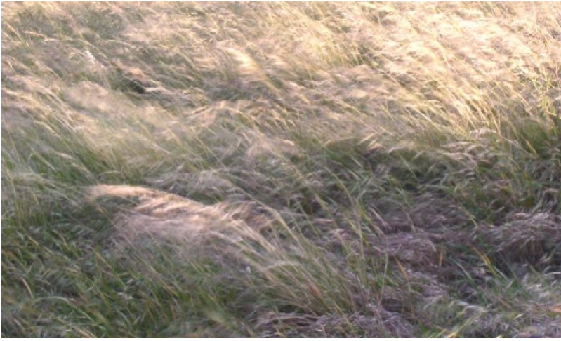
Figure 4. Native Grassland