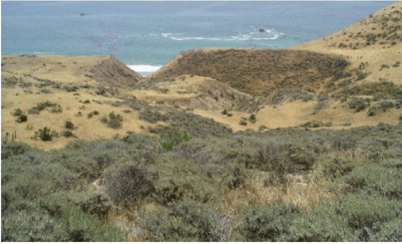
Figure 9. Coastal Sagebrush Scrub

The coastal sagebrush community can invade either the native grasslands or the non-native annual grasslands when the disturbance from grazing and fire is removed. Invasion of coastal sagebrush into the native grasslands is uncommon and different from the recovery of coastal sagebrush in its historical territory. Coyotebrush ( Baccharis pilularis ) often invades first, with California sagebrush coming in afterwards. See the coastal sagebrush ecological sites R020X1100CA and R020X1113CA for more information on this community.