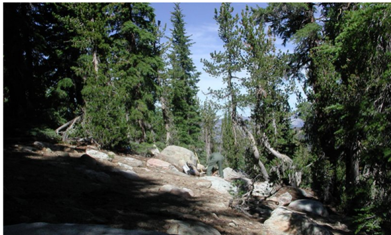
Figure 7. Closed mountain hemlock forest

This community develops with prolonged time since fire (>500 years). The shade-tolerant mountain hemlock continues to establish in the understory, and slowly the stand increases in cover and density. Whitebark pine is overtopped and shaded out by mountain hemlock, and without canopy openings from disturbance, the shade intolerant seedlings will not have significant regeneration. Clark's nutcrackers also prefer to cache seeds in open areas, so the seed supply for whitebark pine is limited under this dense canopy.