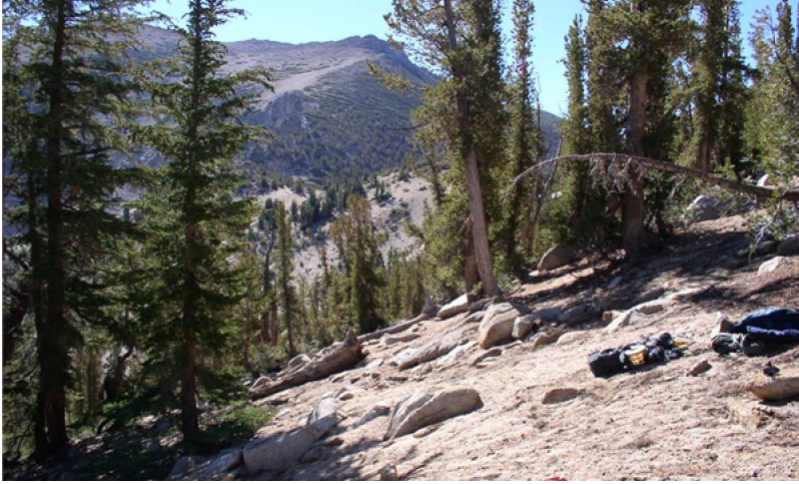
Figure 8. Mature, open mountain hemlock- whitebark pine

This phase is dominated by a canopy of mountain hemlock co-dominated by taller primarily single-stem whitebark pines. Canopy cover ranges 20 to 45 percent. Overstory canopy height ranges from 35 to 55 feet with ages of 150 to 500 years old. Western white pine ( Pinus monticola ) and California red fir may occur in limited amounts. The understory is dominated by litter, gravel, and rock with low cover of graminoid, herbaceous and subshrub species.