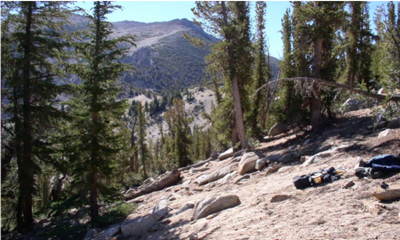
Figure 8. Mature, open mountain hemlock- whitebark pine

This phase is dominated by a canopy of mountain hemlock co-dominated by taller primarily single-stem whitebark pines. Canopy cover ranges 20 to 45 percent. Overstory canopy height ranges from 35 to 55 feet with ages of 150 to 500 years old. Western white pine ( Pinus monticola ) and California red fir may occur in limited amounts. The understory is dominated by litter, gravel, and rock with low cover of graminoid, herbaceous and subshrub species.