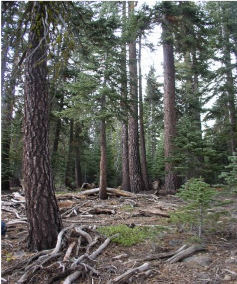
Figure 8. Old Growth infilling

This community phase develops in the absence of fire or other disturbances. Red fir regeneration in the understory, and persistence into mid canopy layers increases forest density and canopy cover. Canopy fire is more likely during this phase due to abundant ladder fuels and increased woody fuel on the ground layer. Pinemat manzanita does poorly in the shade, and gradually declines in the understory.