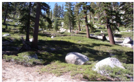
Open Multi-Aged Forest