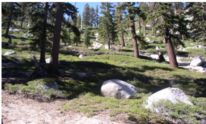
Figure 7. Red Fir Western White Pine Forest

The most successional advanced community phase is a mature California red fir - western white pine forest. The canopy is open with pinemat manzanita being the most common understory shrub. The oldest trees are typically over 100 feet tall with diameters over 30 inches. The age of the dominant trees may range from 250 to 500 years old (Potter 1998). This community is still present in many areas because it is located at upper elevations in remote areas that weren't heavily logged during the Comstock era (from the mid-1870s to the mid-1890s). Small lightning initiated fires, with patchy mortality of overstory trees and light understory burns help keep this forest open.