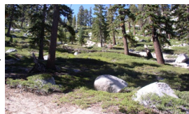
Open Multi-Aged Forest

This pathway develops in the event of a low severity fire, which causes high mortality in the understory, and low mortality of the overstory, opening up the forest structure.