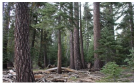
Old Growth Infilling

This pathway develops with a prolonged absence of fire.