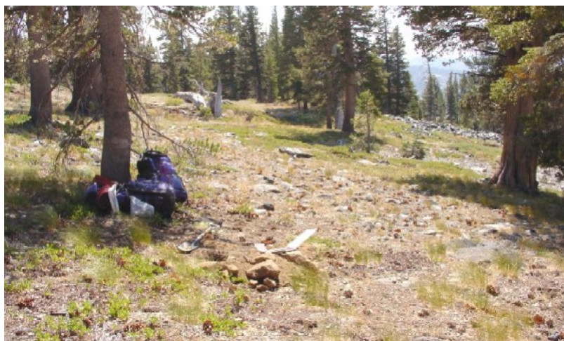
Figure 7. Community Phase 1.1

This community phase represents the most successional advanced community for this ecological site. It is fairly undisturbed by human influences because of its inaccessibility. Sierra lodgepole pine has an open canopy, with several age classes. California red fir and western white pine are present in small amounts, but will not successional replace Sierra lodgepole pine on this site due to the root restrictive till layer and possibly frost issues. The trees in this forest are commonly over 200 years old, but are slow growing due to harsh environmental variables such as a short growing season and low soil fertility. An estimate on life span for this community phase ranges from 125 to more than 500 years.