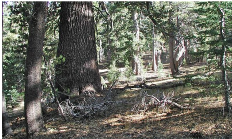
Figure 7. Community phase 1.1

This plant community phase is fairly undisturbed by human influences because of its inaccessibility, so this old growth subalpine mixed conifer community phase is representative of the most successional advanced phase. Mountain hemlock, Sierra lodgepole pine, California red fir, and western white pine create a relatively dense multi-layered forest. The trees in this forest are commonly over 200 years old, and are slow growing due to the short growing season on cool high elevation slopes. An estimate on age for this community phase ranges 125 to more than 500 years.