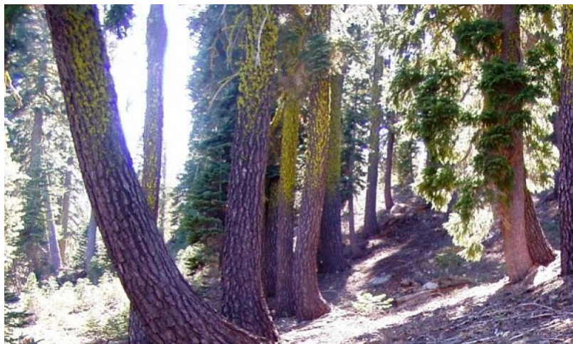
Figure 7. Community Phase 1.3

This forest community phase develops with the natural fire regime, or with manual thinning and prescribed fires. Low to moderate intensity fires clear the understory and remove fuels before they reach hazardous levels. Severe high-intensity canopy fires are also possible and would lead to stand initiation. The density of California red fir and white fir was historically maintained with re-occurring fires every 3 to 37 years that would burn at low to moderate intensity (Bekker and Tayler 2001). California red fir and white fir are shade tolerant and continue to regenerate under the multi-layered canopy. These young trees and seedlings have a high mortality rate even after low intensity fires, which help maintain the open canopy.