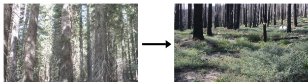
Old-growth forest infilling