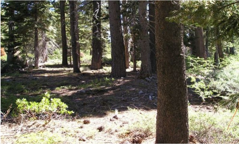
Figure 8. Community Phase 1.3

This is the most common community phase in the Lake Tahoe Basin. The community phase consists of white fir-Jeffrey pine stands with two to three layers, 40 to 60 percent canopy cover, and tree ages ranging from 30 to 125 years. It developed under natural succession with recurring low to moderate surface fires affecting overstory species canopy and composition as well as the amount of understory. Many of the communities in this phase are managed forests, with manual thinning and prescribed burns used to remove white fir and allow for more predominance of Jeffrey pine. The removal of some of the understory creates a somewhat more open forest with less competition between trees.