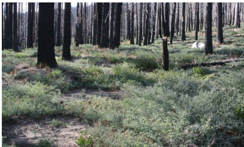
Figure 7. Whitethorn ceanothus 3 years after wildfire.