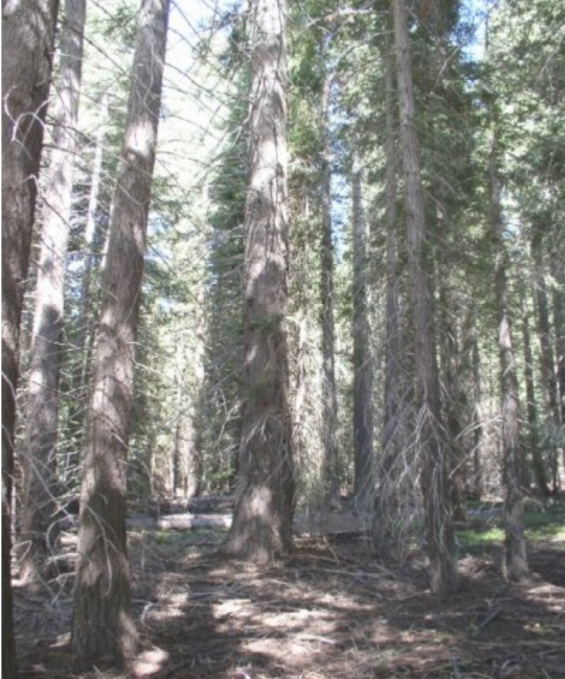
Figure 9. Community Phase 1.5

This community is defined by a dense canopy and high basal area of older white fir (125+ years in age). Canopy cover ranges from 60 to 90 percent including lower tree canopy stories. The trees are often overcrowded and stressed due to competition for water and nutrients, which makes this phase susceptible to death from pests and drought. Wildfire, if and when it occurs, will be severe due to the deep accumulation of litter, the standing dead and down trees, and dense multi-layered structure of the forest. Decimation of the majority of trees can be expected. Forest understory is very sparse to absent.