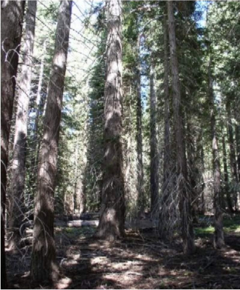
Figure 8. Community Phase 1.5

This community phase is defined by a dense multiple-layer canopy and high basal area of older white fir. Canopy cover ranges from 60 to 90 percent. The trees are overcrowded and often diseased and stressed due to the competition for water and nutrients. Fire hazard is high in this community due to the deep accumulation of litter, the standing dead and down trees, and dense multi-layered structure of the forest.