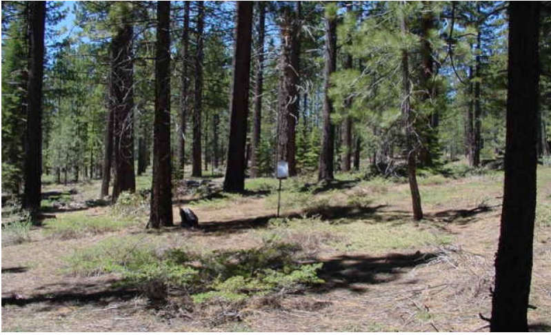
Figure 7. Community Phase 1.3

This community phase is currently the most common expression of this ecological site. It is a heavily managed forest with manual thinning and prescribed burns helping to remove the white fir component and maintain the dominance of Jeffrey pine. The removal of the understory creates a more open forest with less competition between trees. The manual thinning and prescribed burns can replace and emulate the natural fire regime.