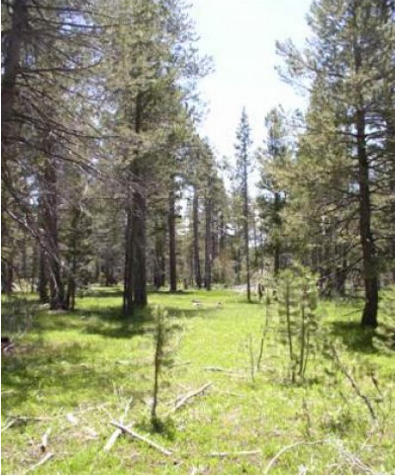
Figure 7. Community Phase 1.3

This young, open Sierra lodgepole pine community phase is dependent partially on the initial density of seedling establishment. In some cases, seedlings establish at different times, and in relatively open distribution. This depends in part on seed storage, time and intensity of fire, and post fire climate conditions. This community's duration ranges up to 60 years. Some reports indicate surface fires historically kept this forest open in the understory. However, it appears that a fire in these dense stands could be moderate to severe. The burns may be patchy, burning just the small dense groves and under the older forest nearby, which would create open conditions in some areas.