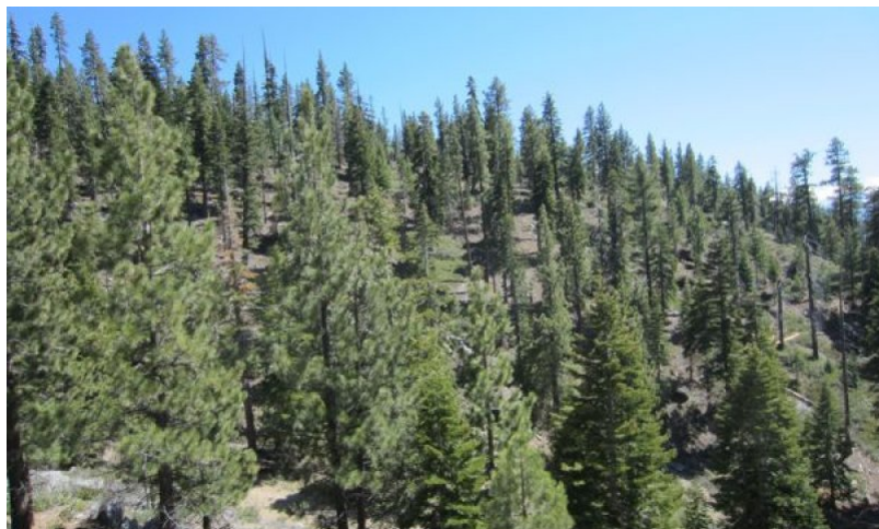
Figure 7. Community Phase 1.3

There are currently some portions of this ecological site that are functioning properly and fit into this plant community phase. However, most of this ecological site has substantial white fir encroachment and is better described in the closed white fir-Jeffrey pine communities. Historically, this community would have developed naturally with frequent surface fires, but manual thinning and prescribed burns now replace the natural fire regime. Manual thinning and prescribed burns remove the white fir component and help maintain the dominance of Jeffrey pine. The removal of the understory trees creates a more open forest structure that reduces the competition between trees and lowers the potential for severe canopy fires.