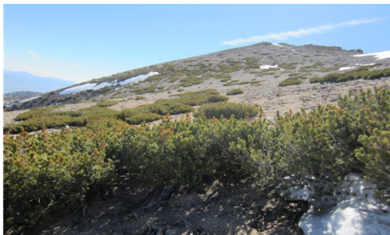
Figure 7. Krummholz Whitebark Pine on Freel Peak