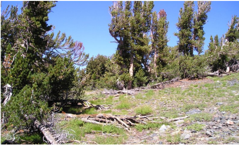
Figure 9. Whitebark pine and forbs WPBR

This community is similar to community 1.1, but the whitebark pine has low to moderate infection rates and severity of stem girdling from white pine blister rust. There may be death of infected younger trees, and dieback of infected branches on larger trees, slightly reducing canopy cover. The understory is unaffected at this time, and is described in State 1.