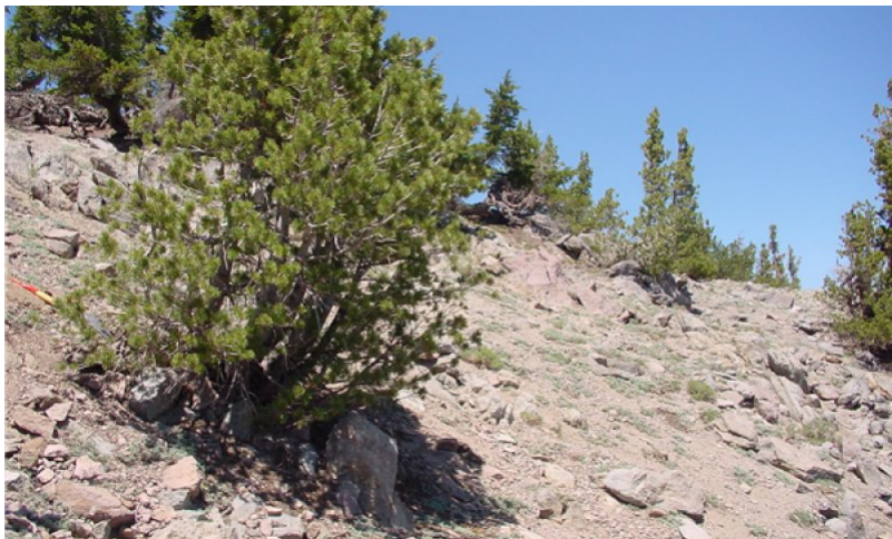
Figure 8. Whitebark pine and forbs

This state has developed with the introduction of the non-native white pine blister rust. The majority of this ecological site has high incidence and infection rates of WPBR, and exists in this altered state.