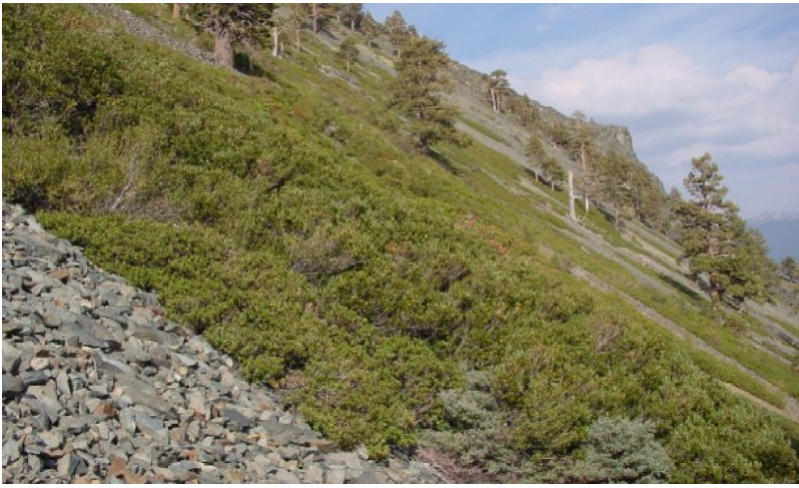
Figure 7. Reference Plant Community

The reference community is montane chaparral dominated by huckleberry oak. Greenleaf manzanita may be locally abundant. Common secondary shrubs present at lower cover include whitethorn ceanothus ( Ceanothus cordulatus ), bitter cherry ( Prunus emarginata ), bastardsage ( Eriogonum wrightii ), roundleaf snowberry ( Symphoricarpos rotundifolia ), sulphur-flower buckwheat ( Eriogonum umbellatum ), Utah serviceberry ( Amelanchier utahensis ), and wax current ( Ribes cereum ). Tree, forb and grass cover is typically insignificant. Trees that may occur on the site include Jeffrey pine ( Pinus jeffreyi ), California red fir ( Abies magnifica ) and Sierra lodgepole pine ( Pinus contorta ssp. murrayana ).