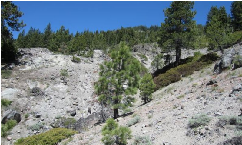
Figure 8. Community Phase 1.1

Patchy chaparral cover, a diverse forb community, and a high cover of bare ground characterize the reference plant community. Average shrub cover is 30 percent, which is dominated by huckleberry oak and greenleaf manzanita. The shrub community is diverse, with up to twelve different species typical. Prostrate ceanothus ( Ceanothus prostratus ), Utah serviceberry ( Amelanchier utahensis ), are important secondary shrubs, and pinemat manzanita ( Arctostaphylos nevadensis ), bitter cherry ( Prunus emarginata ), roundleaf snowberry ( Symphoricarpos rotundifolius ), creeping snowberry ( S. mollis ), and Sierra gooseberry ( Ribes roezlii ) are among the frequently encountered secondary shrubs, but other species may also be present. Trees are scattered and patchy, and favor concave microsites where there is additional run-on and soil accumulation, or colonize shrub patches where there is shade and soils are stable. Prostrate ceanothus is a nitrogen fixing species that can act as a nurse plant for trees and other shrubs (Brown et al. 1971). This site is surrounded by Jeffrey pine ( Pinus jeffreyi ) - white fir ( Abies