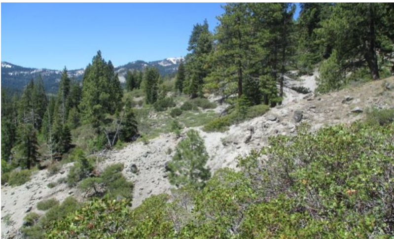
Figure 7. Community Phase 1.1