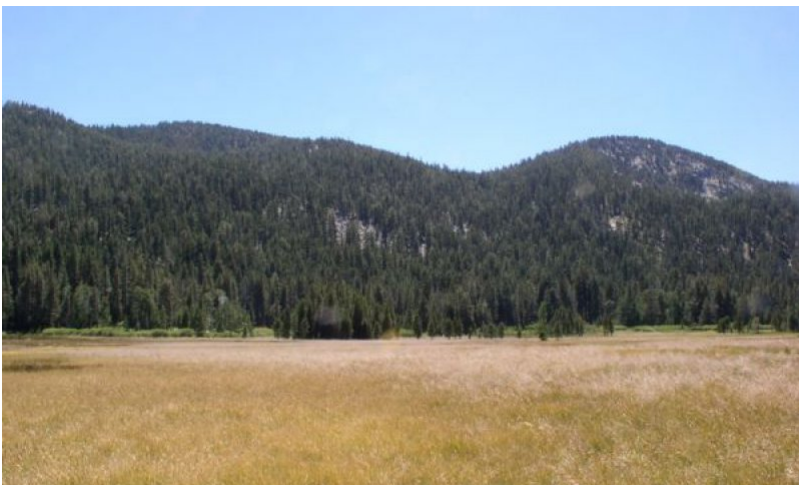
Figure 10. CC4 Meadows