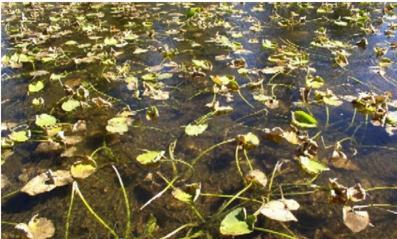
Figure 8. CC1 Ponds