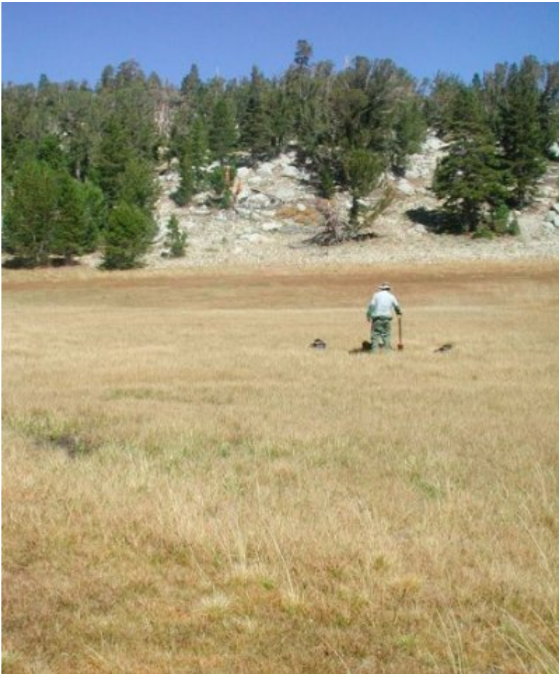
Figure 9. CC3 Fen margins