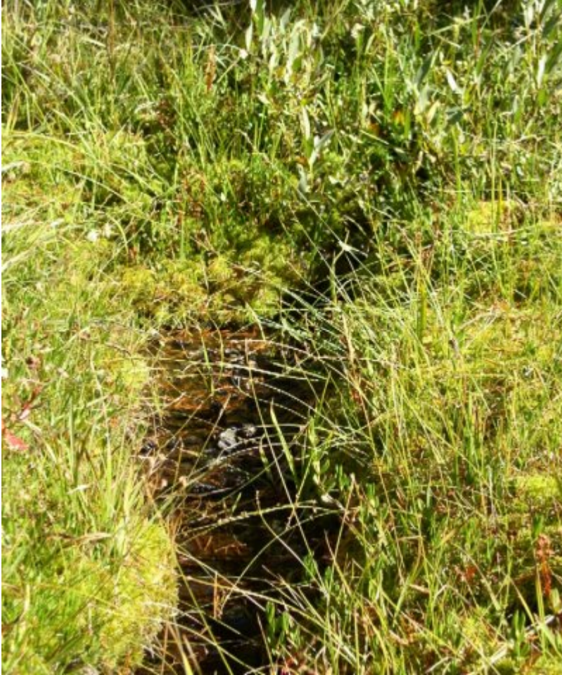
Figure 7. CC2 Fens