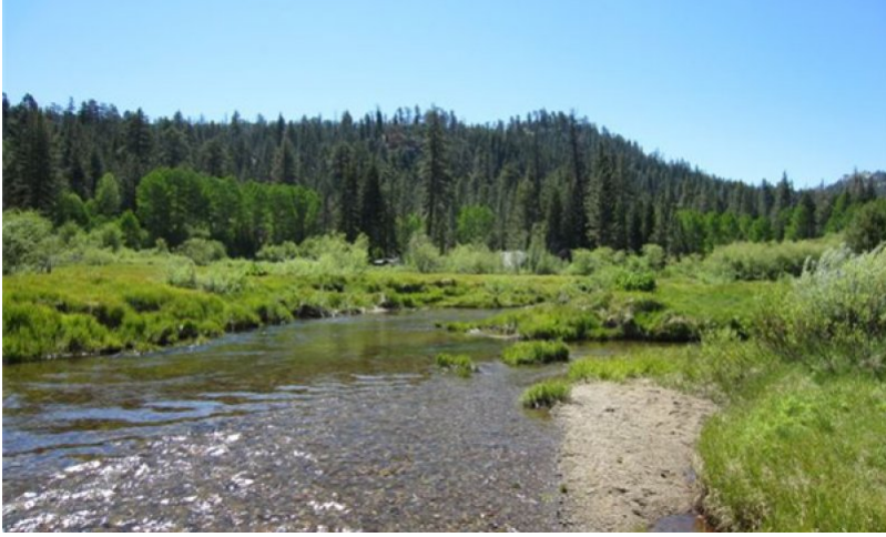
Figure 6. C Channel