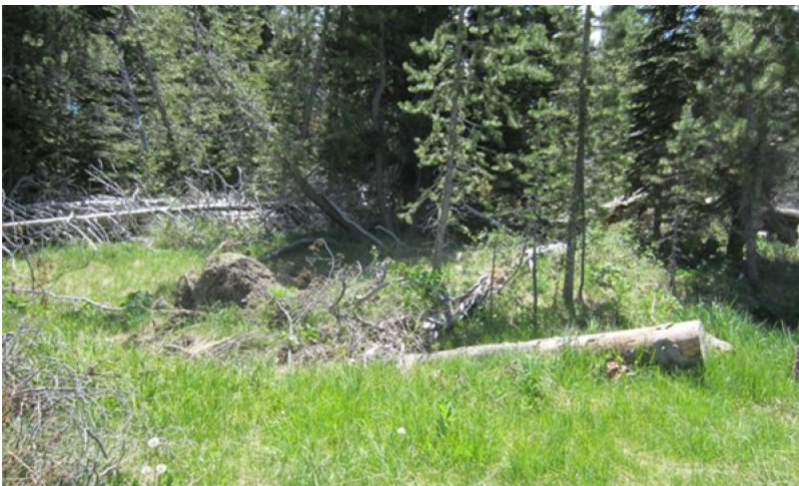
Figure 13. CC4

The D channel phase is characterized by channel aggradation and development of braided channels. This phase has a notable increase in bare or sparsely vegetated gravel deposits. CC1, Gravel bar, active floodplain This community component occurs on active floodplains and gravel bars subject to frequent burial or erosion. Lemmon's willow and shining willow ( Salix lucida ) can sprout and establish from broken stems that get buried in flood deposits. Willows are also tolerant of stem breakage from flood debris and sediments. Pioneer forbs dominate on early succession phase on gravel bars, such as Pacific lupine ( Lupinus lepidus ), naked buckwheat ( Eriogonum nudum ), silverleaf phacelia ( Phacelia hastata ), common yarrow ( Achillea millefolium ), Douglas' sagewort ( Artemisia douglasiana ), thickstem aster ( Eurybia integrifolia ), Holboell's rockcress ( Arabis holboellii ), scarlet gilia ( Ipomopsis aggregata ), and clover ( Trifolium sp.). This community has a diversity of annual and perennial forbs. As the willows establish, they capture fine sediments from gentler flood episodes, and accumulate organic matter over time. Canopy cover of willows increases, and cover and diversity of forbs and grass and grass-likes increases. In more stable areas, forbs include nettleleaf giant hyssop ( Agastache urticifolia ), western pearly everlasting ( Anaphalis