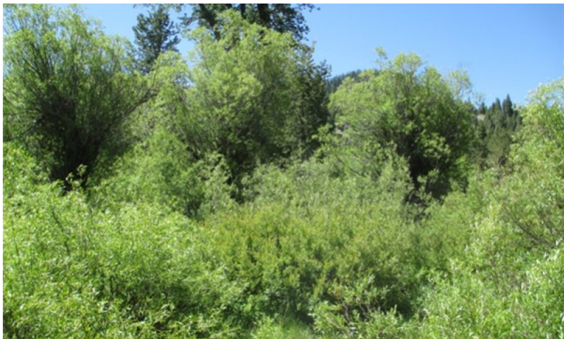
Figure 10. CC1