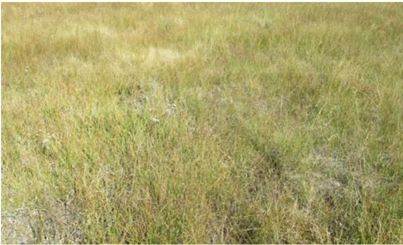
Figure 12. CC3