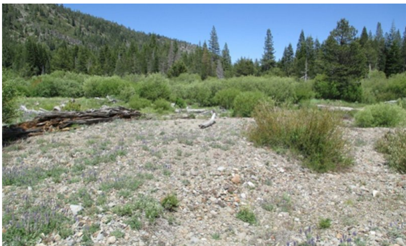
Figure 9. Gravel Bar