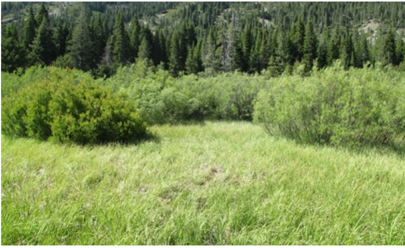
Figure 11. CC2