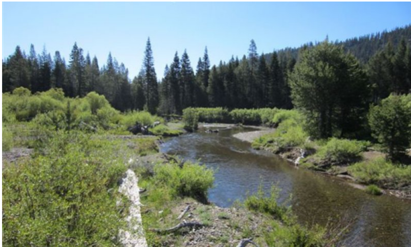
Figure 8. D Channel