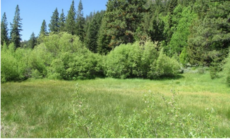
Figure 7. CC2