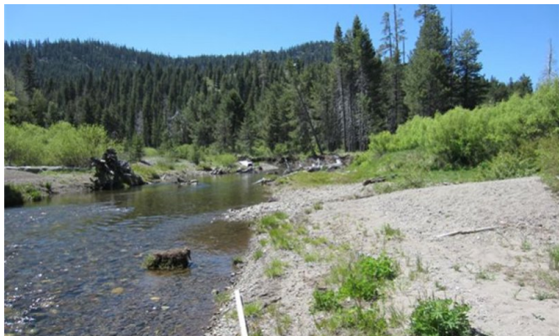
Figure 15. F Channel

This phase is defined by a wide, deeply incised F type channel. The communities are similar as described in the G type channel.