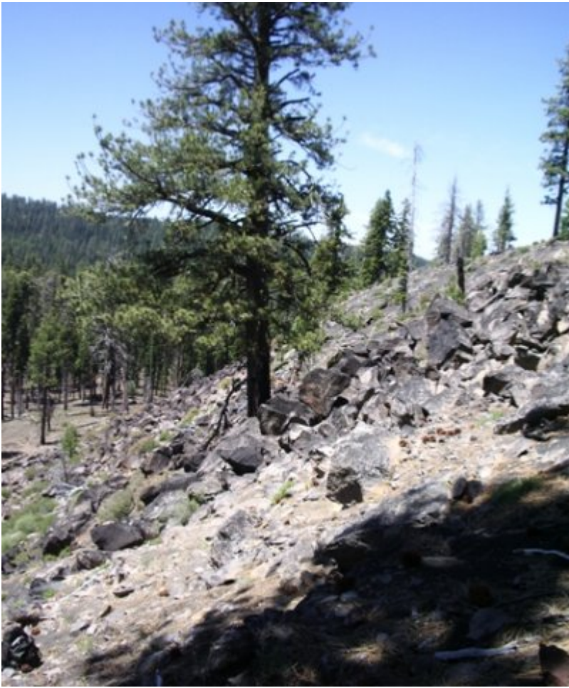
Figure 4. Talus Slope

Plant community 1.1 is the climax community associated with this ecological site. Dominant shrubs include oceanspray ( Holodiscus discolor ) and bush chinquapin ( Chrysolepis sempervirens ). These are common climax species on harsh rocky sites. Total shrub cover will remain low, growing in patches. Jeffrey pine ( Pinus jeffreyi ) is present, growing and regenerating at a very slow rate; total canopy cover will remain below 25% in the late seral stages. Jeffrey pine can be a climax species, especially on harsh sites (Gucker, 2007) where they will not be crowded out by more shade tolerant species. Grasses and forbs are a minor component of this plant community and include western snakeroot ( Ageratina occidentalis ), prickly hawkweed ( Hieracium horridum ), scabland penstemon ( Penstemon deustus ), whiteveined wintergreen ( Pyrola picta ), western needlegrass ( Achnatherum occidentale ) and squirreltail ( Elymus elymoides ). The limiting resources on this site prevent most of these species from reaching their maximum productivity potential.