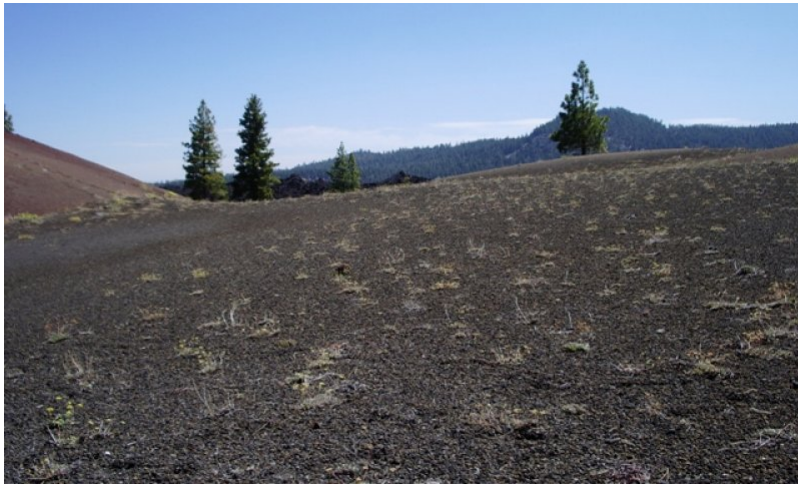
Figure 4. Bedded tephra deposits ecological site