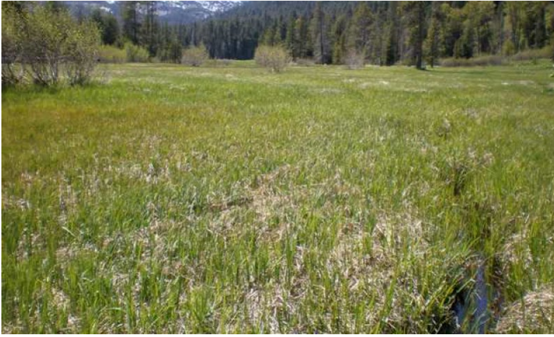
Figure 3. Frigid Alluvial Flat