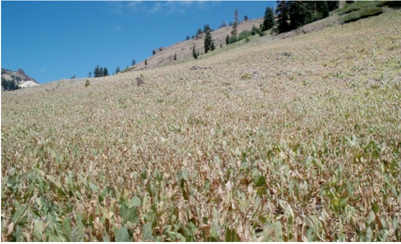
Figure 3. Moderately Deep Fragmental Slopes

Plant community 1.1 is the reference plant community for this site and is chiefly made up of vigorous forbs like woolly mule-ears ( Wyethia mollis ), arrowleaf balsamroot ( Balsamorhiza sagittata ) and bluntlobe lupine ( Lupinus obtusilobus ). Total canopy cover ranges from 30% and 50%, depending on the location.