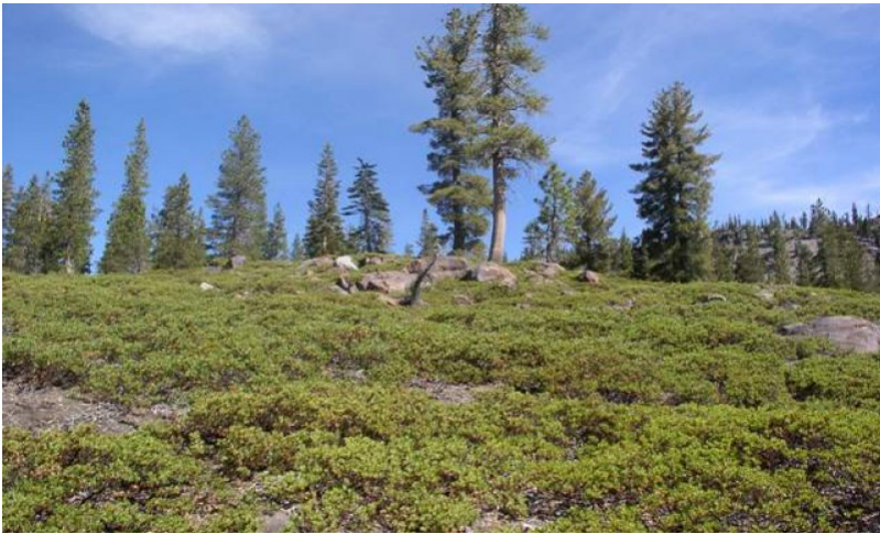
Figure 3. Glaciated Mountain Slopes

Community phase 1.1 is the reference community for this ecological site. It consists of scattered mature trees with an extensive understory of pinemat manzanita ( Arcostaphylos nevadensis ). Tree species include western white pine ( Pinus monticola ), California red fir ( Abies magnifica ), mountain hemlock ( Tsuga mertensiana ) and Sierra lodgepole pine ( Pinus contorta ssp. murrayana ). Large scale disturbances do not regularly occur on this site, creating the potential for plant community 1.1 to remain relatively unchanged for decades and possibly centuries.