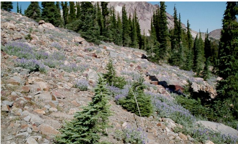
Figure 4. Alpine slopes

This plant community is associated with a late successional community on this ecological site. Mountain hemlock trees are present but are mostly widely scattered and small or shrubby. Total canopy cover is less than 20%. Vegetation can vary from site to site but the most common species associated with this plant community are bluntlobe lupine ( Lupinus obtusilobus ), mountain pride ( Penstemon newberryi ), woodrush ( Luzula spp.), and Howell's pioneer rockcress ( Arabis platysperma var. howellii ). Other species found in smaller quantities on this ecological site may include Ross' sedge ( Carex rossii ), squirreltail ( Elymus elymoides ), western needlegrass ( Achnatherum occidentale ), mountain monardella ( Monardella odoratissima ), purple mountainheath ( Phyllodoce brewerii ), prickly hawkweed ( Hieracium horridum ), Sierra cliffbrake ( Pellaea brachyptera ), Shasta knotweed ( Polygonum shastense ), Mt. Hood pussypaws ( Cistanthe umbellata var. umbellata ), dwarf mountain ragwort ( Senecio fremontii ), Davidson's penstemon ( Penstemon davidsonii ), King's sandwort ( Arenaria kingii ) and various buckwheat species ( Eriogonum spp.). There are minor amounts of tree and shrub species present in various