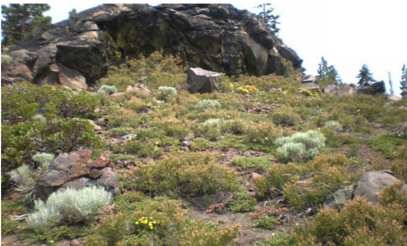
Figure 4. Cryic Pyroclastic Cones

A mixed shrubland with forbs and grasses is the reference community for this ecological site. Trees will not successionally replace this community due to the characteristics of the site mentioned above. The dominant species include oceanspray ( Holodiscus discolor ), prostrate ceanothus ( Ceanothus prostratus ), and rabbitbrush ( Ericameria nauseosa ssp. nauseosa var. nauseosa ). Shrubs like oceanspray ( Holodiscus discolor ), bush chinquapin ( Chrysolepis sempervirens ), and greenleaf manzanita ( Arctostaphylos patula ) are well suited to this site. Oceanspray ( Holodiscus discolor ) occurs in many successional communities and is well adapted to fire and disturbance (Archer 2000). Bush chinquapin ( Chrysolepis sempervirens ) is very tolerant of the harsh, rocky conditions found here, and the seeds are preferred food for small mammals and birds (Howard 1992), attracting various wildlife species to the site. Greenleaf manzanita ( Arctostaphylos patula ), whose seeds are commonly