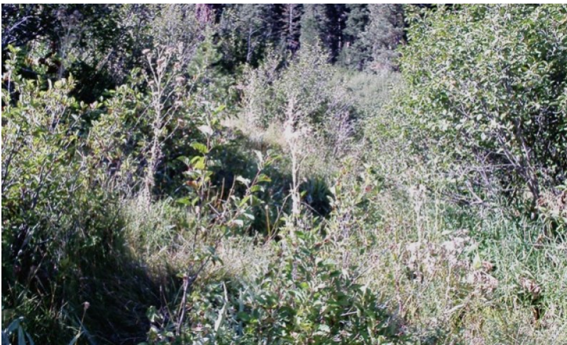
Figure 4. Thinleaf Alder and Herbaceous Community