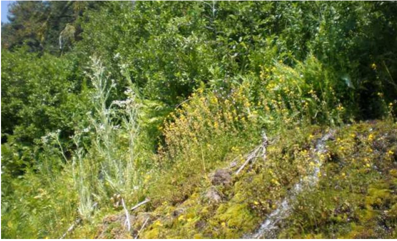
Figure 3. Seep Monkeyflower Community