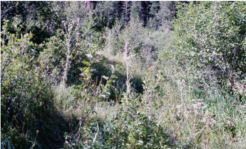
Figure 4. Thinleaf Alder and Herbaceous Community