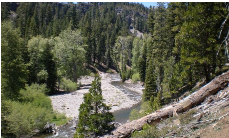
Figure 5. Gravelly Flood Plains, Kings Creek