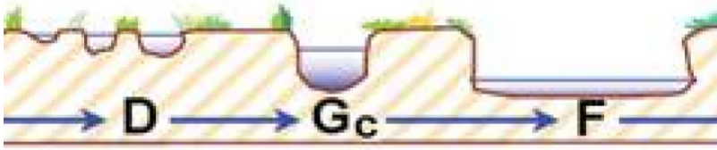
Figure 4. Rosgen Stream Succession Scenario 3