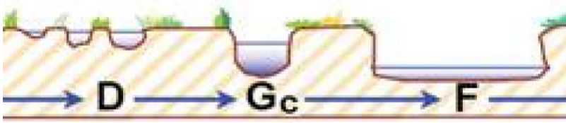
Figure 4. Rosgen Stream Succession Scenario 3