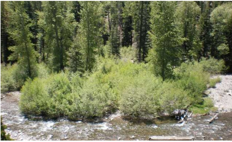
Figure 6. Gravelly Flood Plains